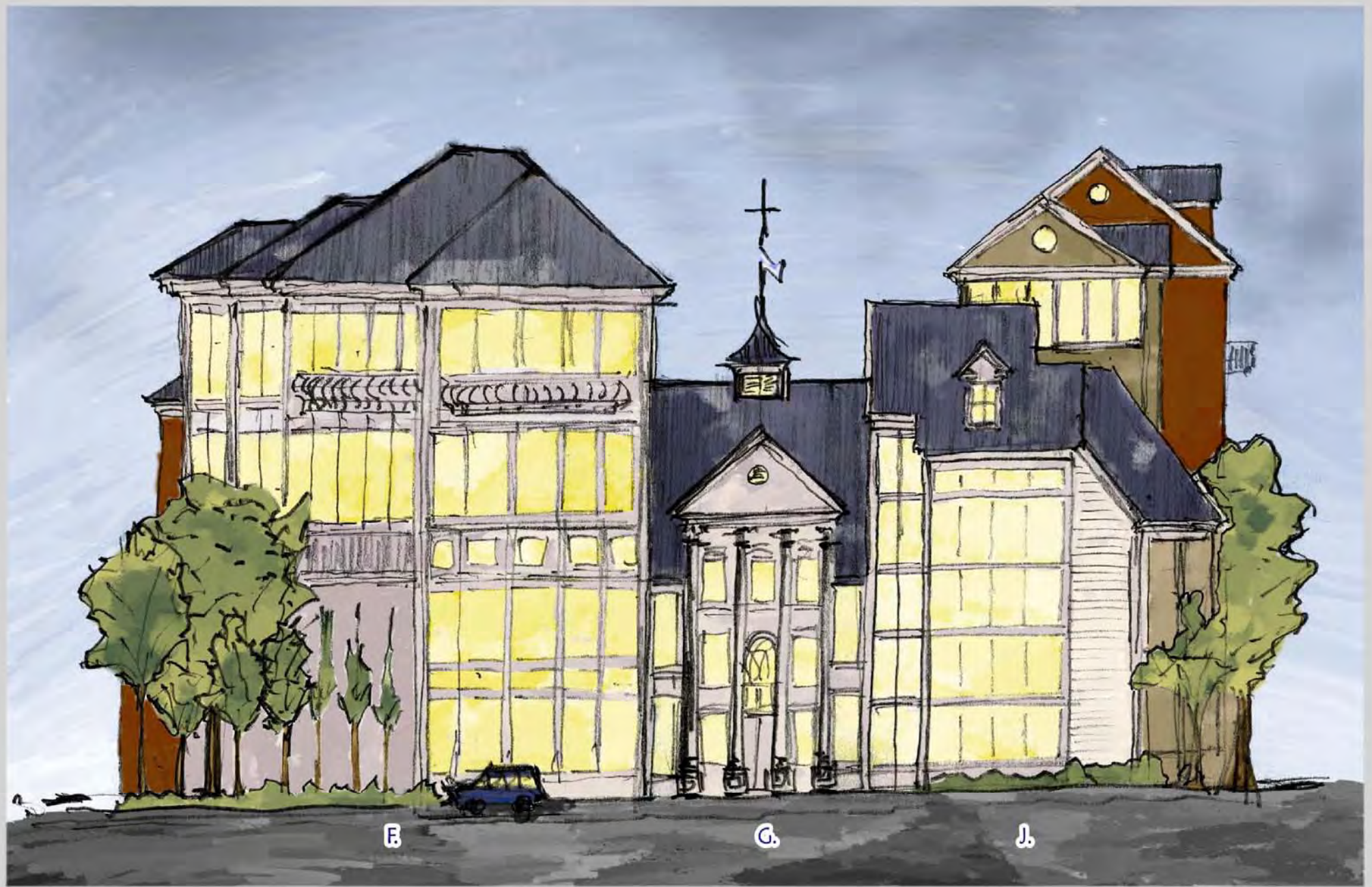
MAIN ENTRANCE VIEW