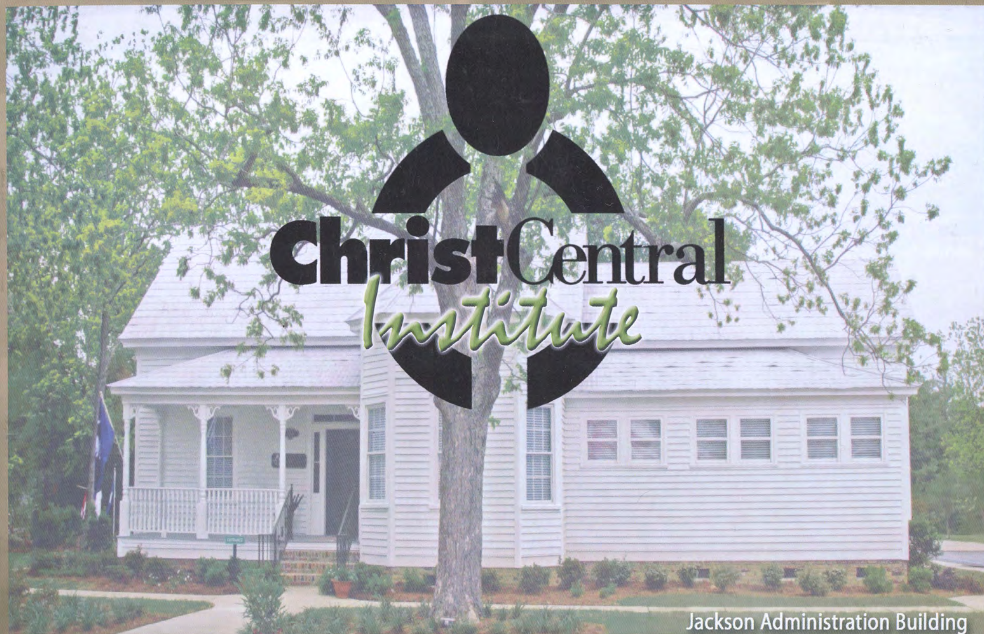
Jackson Administration Building